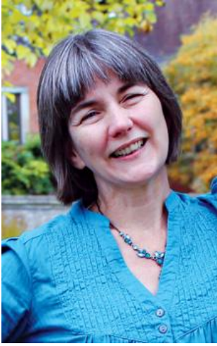
Messy Church: Fresh Ideas for Building a Christ-Centered Community

Available September 12, 2017 $16, 210 pages, paperback 978-0-8308-4138-7